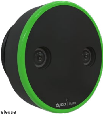
*In future release

Field integration to iSTAR controllers can be done either through Wiegand or *OSDP Secure Channel.